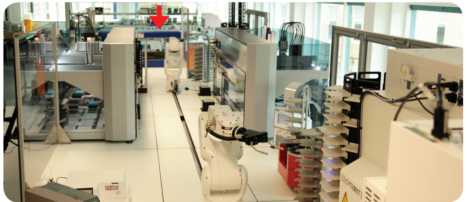
Figure 3. Part of EGF's fully automated setup is shown here. The QPix Select-HT system (red arrow) is in the upper left, behind the robotic arm. A second robotic arm is also visible, approaching a plate hotel.