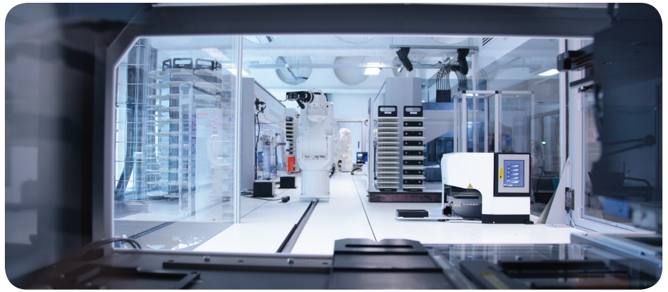
Figure 2. View from the inside of the QPix Select-HT system, looking out towards the automated platform.

The close collaboration between Molecular Devices' AWES team and the Edinburgh Genome Foundry resulted in an effective solution to their specific workflow needs, allowing the EGF to meet their goal of a fully automated platform for DNA assembly.